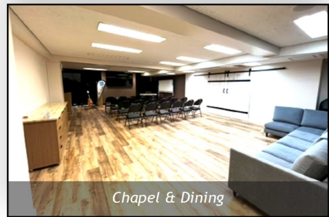
Chapel & Dining