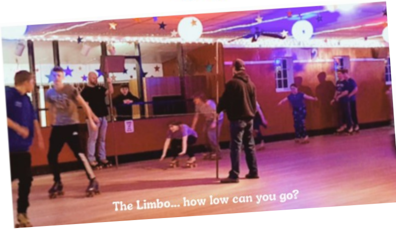
The Limbo... how low can you go?