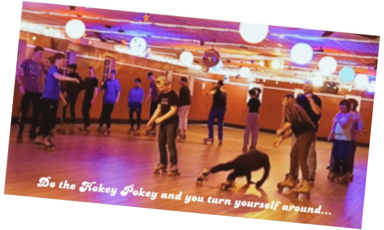
Do the Hokey Pokey and you turn yourself around...