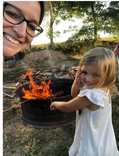
Isn't that such an innocent face!

Join us every Wednesday for a fellowship meal at 6 followed by our regular program. It's going to be a great year growing closer to Jesus!!